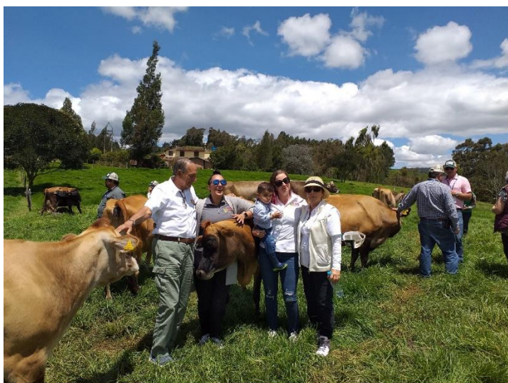
Builes Family showing the best cows

Before starting the tour to see the animals and the facilities, the records of production and the data of reproduction were presented by Lorena. Then the vet Wilmar Granados explained the selection program based on genomic tests in all the herd.